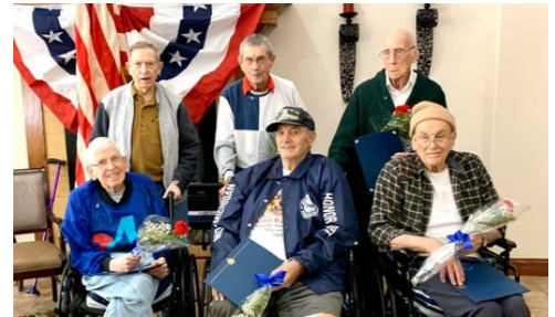
Honoring Veterans @ The Brook of Houghton Lake (above) and The Brook of West Branch (below). Gentlemen, thank you for your service!